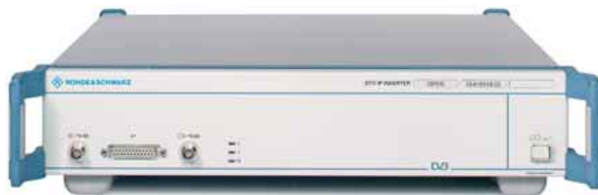
DTV IP Inserter and Generator R&S DIP010